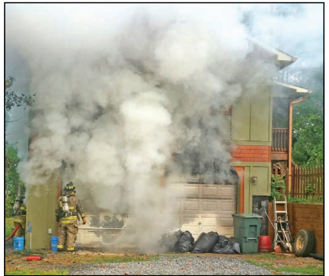
No one was hurt and this home was saved as a result of the total knockdown efforts of Towns County Fire & Rescue in early September.