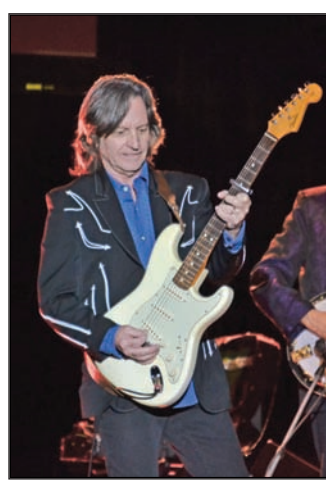
Jeff Hanna, lead singer and guitar player for Nitty Gritty Dirt Band, kept the audience entertained with verbal jests between classic Dirt Band hits on Saturday, Oct. 1.

"I just want to take the opportunity to say this," said Jeff Hanna, Dirt Band lead singer. "Doing this for 50 years, it's not lost on us how lucky we are to be able to play music. It's so much better when people actually show up.