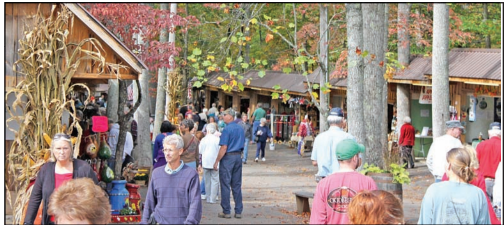
The 2016 Fall Festival promises to live up to festivals of years gone by, with plenty of music, authentic Mountain Arts & Crafts, and the festival's newest edition – helicopter rides.