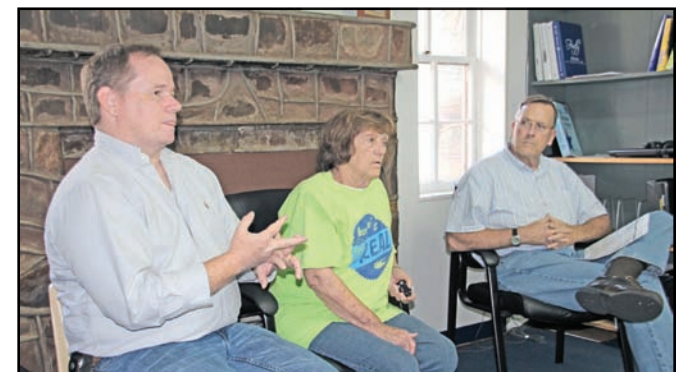
The Towns County Board of Elections and Registration met for a special called meeting on Tuesday, Sept. 27, to decide what to do about issues of residence for a handful of Hiawassee voters ahead of the Nov. 8 Municipal Election.

These eight people share two important things in common: one, they own businesses within Hiawassee City Limits, and two, the board of elections has determined that they are not Hiawassee