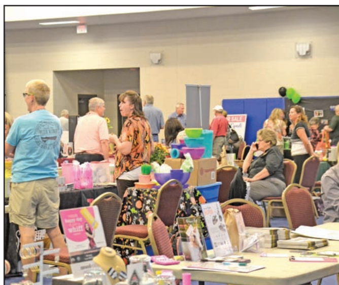
The Towns County Recreation and Conference Center played host to the Second Annual Business Showcase, sponsored by the Towns County Chamber of Commerce.

"We plan to have this every year," said Chamber